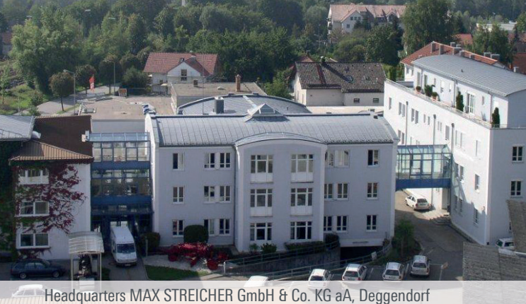
Headquarters MAX STREICHER GmbH & Co. KG aA, Deggendorf