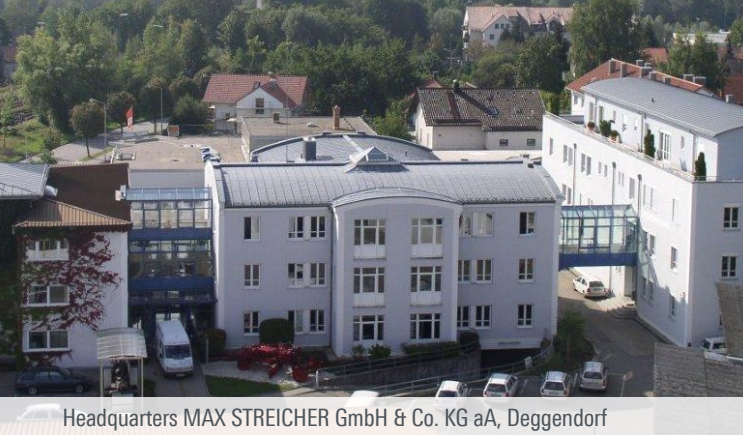
Headquarters MAX STREICHER GmbH & Co. KG aA, Deggendorf