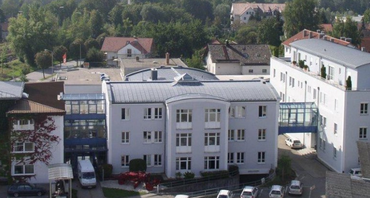
Headquarters MAX STREICHER GmbH & Co. KG aA, Deggendorf