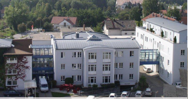
Headquarters MAX STREICHER GmbH & Co. KG aA, Deggendorf