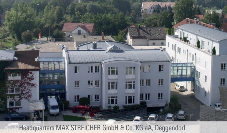
Headquarters MAX STREICHER GmbH & Co. KG aA, Deggendorf